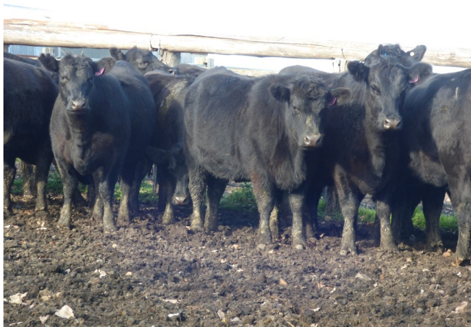
Palgrove Pastoral Co